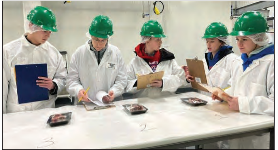
Members of the Kansas 4-H meats judging team are shown here during a recent practice. The team placed fifth at the recent Western National 4-H roundup in Denver.

Also at this year's Western National 4-H Roundup, contests were held for meat judging, horse judging, and horse bowl. The state champions from Kansas also were represented.