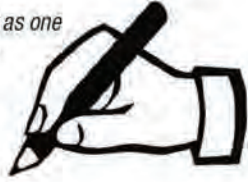
FIGURE YOUR COST HERE: