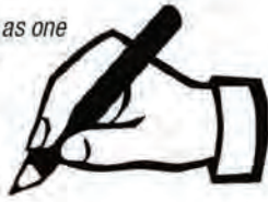
FIGURE YOUR COST HERE: