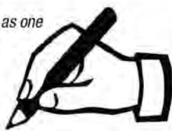
FIGURE YOUR COST HERE: