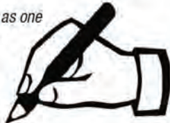
FIGURE YOUR COST HERE: